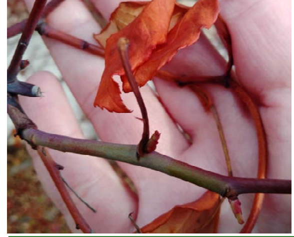
Cold damaged leaves are still attached, but will soon be pushed out by new leaves unfurling from the leaf buds.

Damaged cane with some living tissue and buds swelling